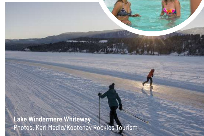
Lake Windermere Whiteway