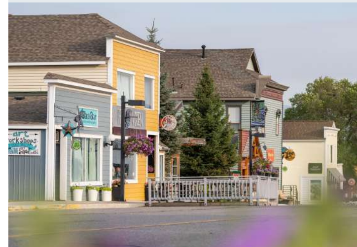
Downtown Invermere

Visit local art galleries, boutiques, shops, restaurants, and cafes in the downtown areas. Plus, explore fun art experiences and attractions for the whole family.