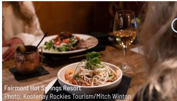
Fairmont Hot Springs Resort

Experience the great dining of the Columbia Valley. From pub fare, local coffee, tasty bakeries, German-Austrian cuisine and more, find your next delicious meal by visiting TravelColumbiaValley.com/Find-a-Restaurant/