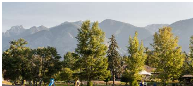
Kinsmen Beach

Find great places to stay no matter what you are looking for. From a family friendly getaway, a cozy lodge for two and everything in between. Find great places to stay by checking our all of the comfortable options available and book your stay by visiting TravelColumbiaValley.com/Stay