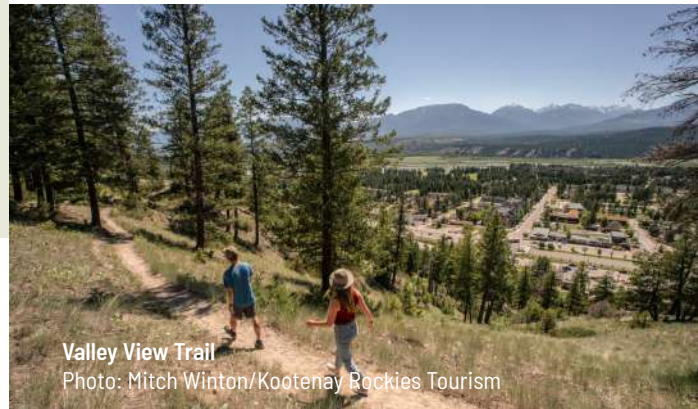
Valley View Trail

Visit the communities of the Columbia Valley! From Radium Hot Springs to Canal Flats, explore the endless adventures in the Columbia Valley.