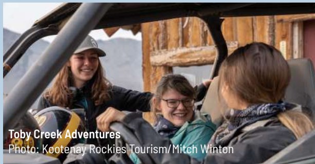
Toby Creek Adventures

Visit TravelColumbiaValley.com to find more great places to eat, things to do, and places to stay all year round. While you are here, visit one of the local Visitor Centres with locations in Radium Hot Springs and Invermere to chat with a local expert.